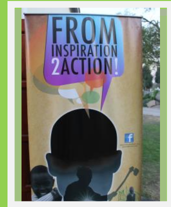
This year’s theme: From Inspiration to Action