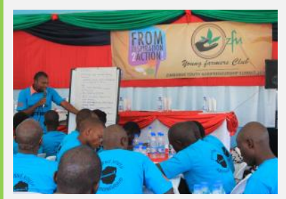
Presentations of the World Café findings