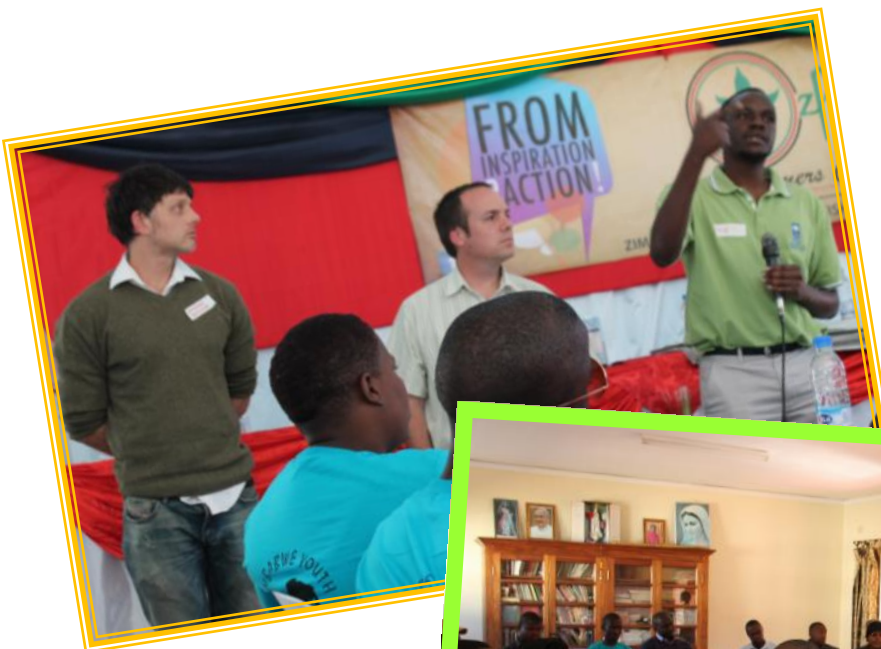
Impressions from the “Farming Fussion”

“Farming Fussion” to develop ICT’s for Agriculture tailor-made for the needs of Zimbabwean Young Farmers was just the beginning of a constructive collaboration between ZFU and UNDP as well as various stakeholders in the sector.