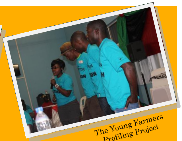
The Young Farmers Profiling Project