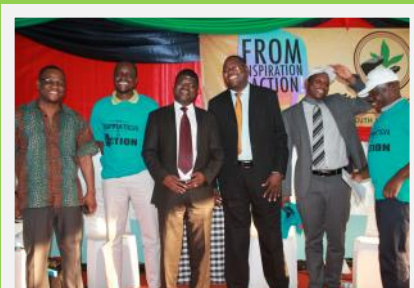
Panellists after the discussion