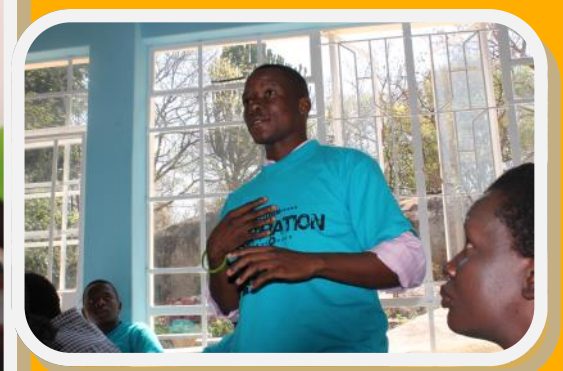
Impressions from the "Farming Fussion"